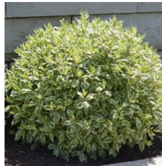
Ivory Halo Dogwood