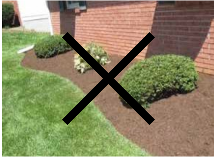
No ground cover