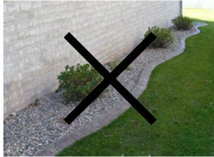
Not enough plant material