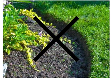
No edger installed