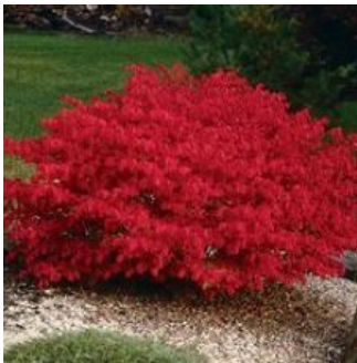
Turkestan Burning Bush