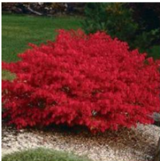
Turkestan Burning Bush