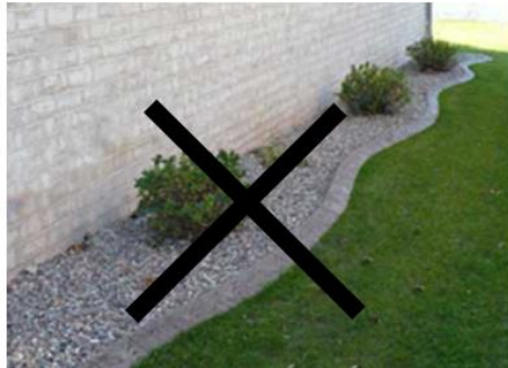
Not enough plant material