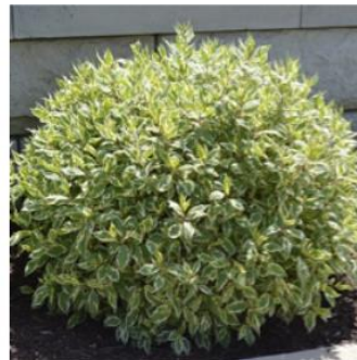
Ivory Halo Dogwood