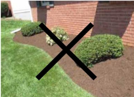
No ground cover