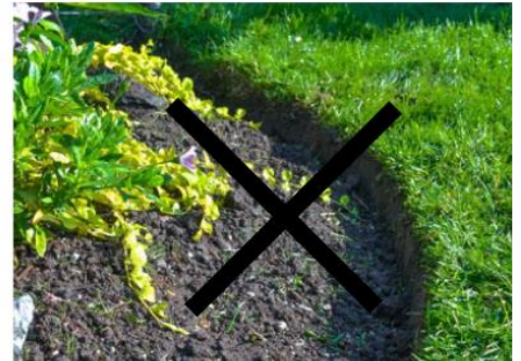
No edger installed